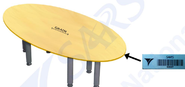
Typical 6 Seater Boardroom Table

NOTE: Chair type for Table-10 is CHAIR-01-M-X